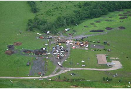
Jackson County damage

campus. K-113 highway was closed, along with many streets. The KHP Command Bus responded to the Chapman area. KHP aircraft responded to Riley County to assist with search and rescue and damage assessments. In Jackson County, one fatality was reported. There were homes destroyed, trees damaged, and much debris in the area. In Soldier, a house-to-house search was conducted. K-62 highway into Soldier was closed.